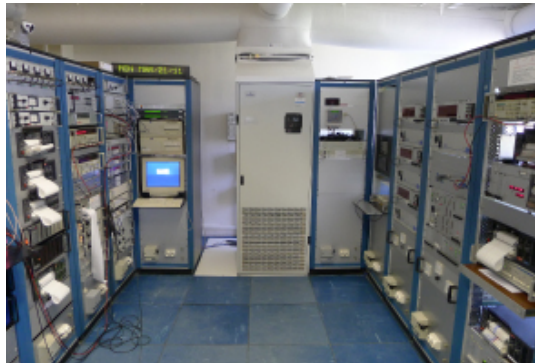
The control room for French civil time, at the Paris Observatory.

This is the fourth generation of speaking clock, the fruit of decades long improvements. It was commissioned in 1991. Designed and managed by the Orange telephone operator, and available through a phone call to 36 99, it is housed at the Paris Observatory, in the « time room » of the SYRTE. Servoed to a hydrogen maser - the time piece - of the SYRTE, it distributes the Universal Coordinated Time of the Paris Observatory, which constitutes today the standard for French civil time, made by the scientific teams of the LNE-SYRTE.